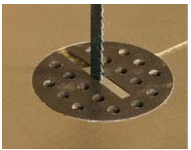
A perforated insert surrounds the blade with dust collection ports.

To help capture dust from above the table we developed a special insert plate with a grid of through holes. This creates a vacuum source surrounding the blade at the table surface to catch much of the dust other bandsaws leave on the surface.